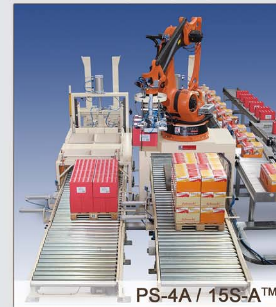
PS-4A / 15S-A™